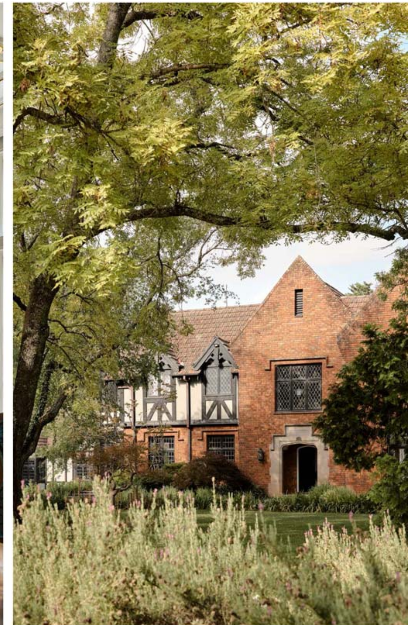
Words CHRIS PEARSON

A meal to remember at a flamboyant restaurant informed