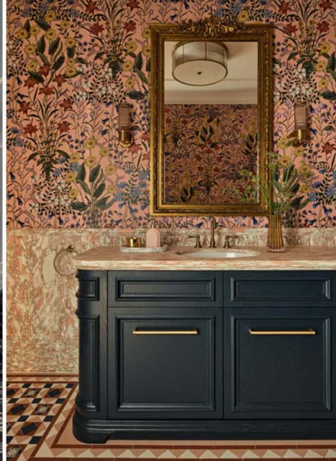
This page 'Glade' wallpaper from Gucci was selected for the trophy room. Ceiling in Dulux Tranquil Green. Antler chandeliers from RH. Refurbished doors in Dulux Sharp Blue. Jonathan Charles coffee table from Cromwell. Classic chesterfield and club chair from Coco Republic. Client's swivel tub chairs in Dedar Milano 'Tiger Mountain' from South Pacific Fabrics. 'Harbourside' table from Xavier Furniture. 'Alcala' drinks table from Kindel Furniture Company. Cushions in Aldeco 'Interception' from Domestic Textiles. Opposite page (from top left) Dulux Blue Garter covers the pool room walls and ceiling. Flooring from Renditions Tiles. Lantern from Visual Comfort. Sika Design loungers and chair from Domo. Tiffany lamp and other items, client's own. // In the powder room is 'Flora' wallpaper from Gucci. Norwegian rose marble from TeraNova. // The bar is beautiful Victorian walnut. Mirror by Spectrum Art Glass. Stools from Cromwell.